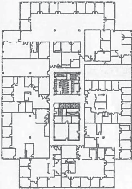
THIRD FLOOR KEY PLAN